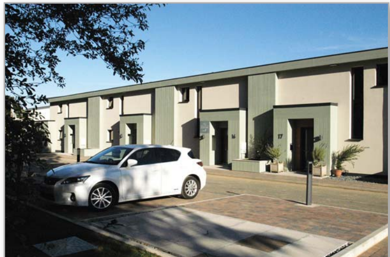
Gusto Homes "The Edge" Lincoln

Part of the overall strategy of the development was to remove the need for a gas supply to the site and the need for a gas central heating system and hot water boiler. The homes are purely electric with Infra-red heating panels and electric immersion heaters for hot water. The properties have 4 – 5 KW/p of PV on them with a power diverter which means the majority of the power required to heat the hot water is self-generated. The aim of reducing energy consumption within the properties whilst using a simple electric water heating system therefore required the demand for hot water to be as low as possible.