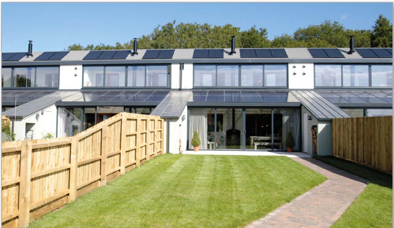
Gusto Homes properties with high energy performance products including the Recoup Pipe+ HE

Information above was provided by Stef Wright and from Gusto Homes “The Edge” website and brochure ( www.gustohomes.co.uk/the-edge ). See additional information on Gusto Homes website.